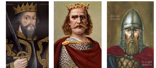
Three claimants to the throne.