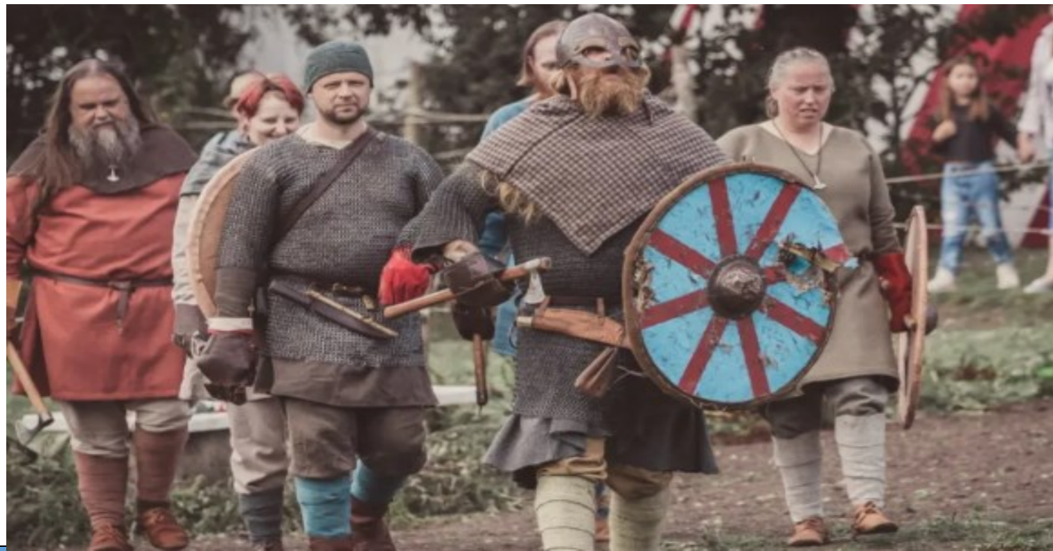
Timeline of the Anglo- Saxons